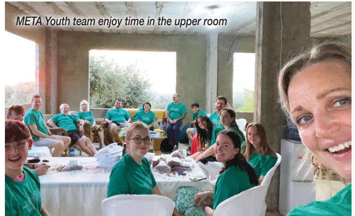
META Youth team enjoy time in the upper room