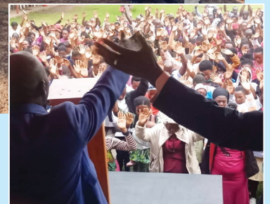
Right: Crowds gather across the diocese in South Rwenzori for week of mission