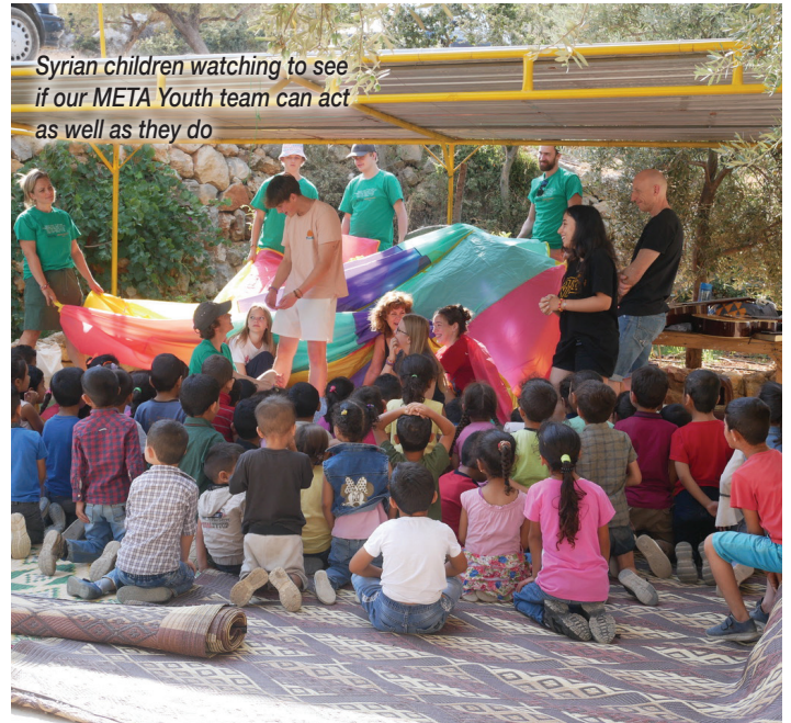
Syrian children watching to see if our META Youth team can act as well as they do

I was converted when I went on a church mission to Romania, aged 17, when suddenly out of my depth, I prayed for the Holy Spirit. So I have always been keen young people experience the Global Church. As the second cohort begins we are preparing for a new mission trip on another continent, and wondering how God might use SOMA UK and META Youth programme to change many lives in the UK and beyond.